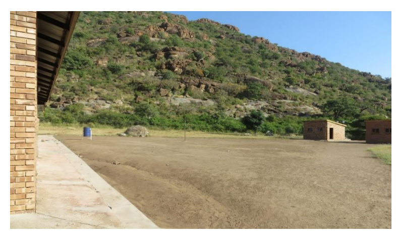
Above: Proposed site for toilets at Maboragane School, which are yet unbuilt. The two buildings on the right house the eight toilets currently serving the school's 175 students and 6 staff members.

A site visit on 9 April 2021 suggested that no work had been done at Maboragane School at that point.