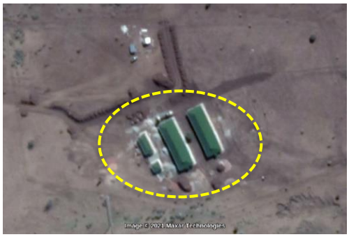
Above left: June 2016, The site of Seroletshidi School at Ga-Mampa.

Above right: June 2017, it seems that construction was completed between June 2016 and June 2017, except for the pavement which is still being constructed here.