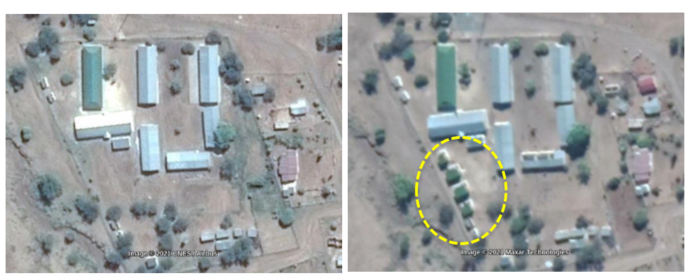
Above left: April 2016, Matianyane Primary, Tjibeng.

Above right: June 2017, it seems that several small buildings, probably toilets, in the left bottom quadrant were built between April 2016 and June