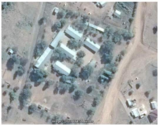
Above left: August 2012, Makgalanoto School. Above right: June 2016, Makgalanoto School. No new buildings visible since 2012.