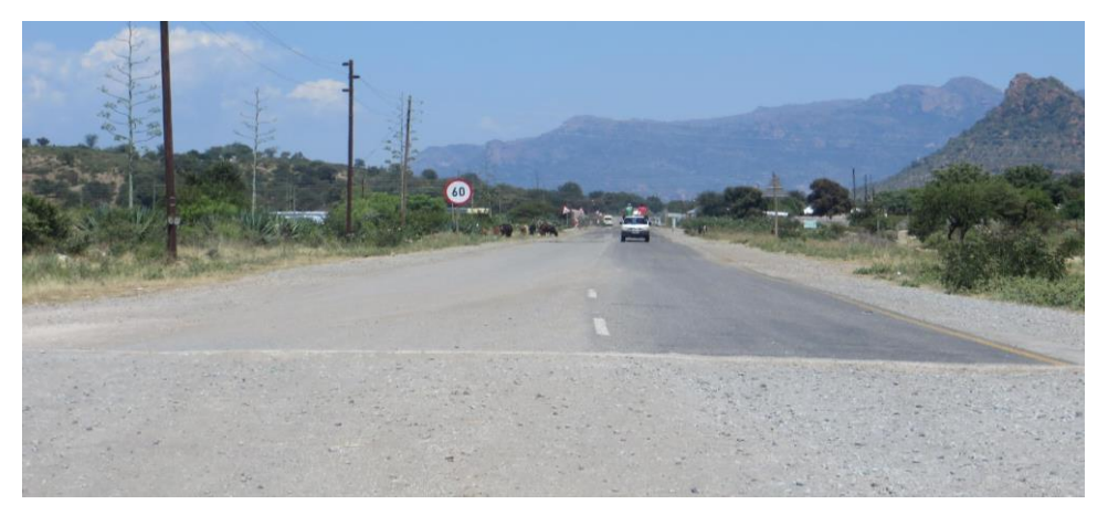
Above: The end of the gravelled section of road, looking in the direction of the Marula mine.

While findings are subject to the 2020 annual compliance report, which the research team were unable to obtain through the PAIA request, the 2020 ESG Report stated that the company had met its commitment even though photographic evidence suggests that the project might not have fully achieved the above-stated objective of addressing the problem regarding the dust on the road and that the company only partially complied with its commitment. At the time of printing this report, Marula had not responded to our right of reply letter dated 6 December 2021 outlining these findings.