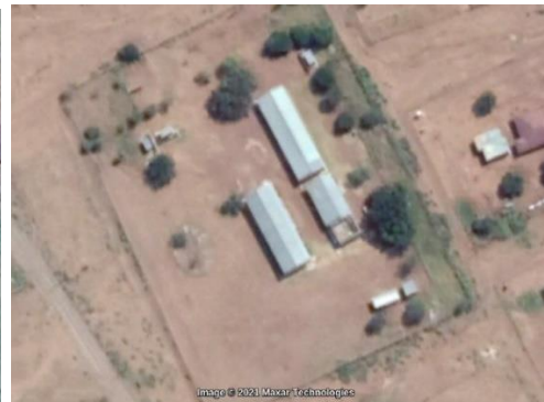
Above left: April 2016, Malegase School

Above right: March 2020, Malegase School with no new buildings. One building seems to be missing a part of its roof. It seems that the 30sqm administration block mentioned in the SLP was not built.