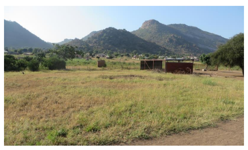
Above: The proposed site for the installation of underground sanitation tanks, which also remain unbuilt.

Based on the 2018 annual compliance report, the company was in non-compliance with its 2018 project deadline, and as explained above, they have effectively admitted that they are in non-compliance with the overall end of 2020 SLP deadline. Further, the company did not even obtain a formal amendment to the 2016-2020 SLP to adjust the timeframes and admitted that completion of the project was only planned for November 2021, outside the binding deadlines of the entire SLP.