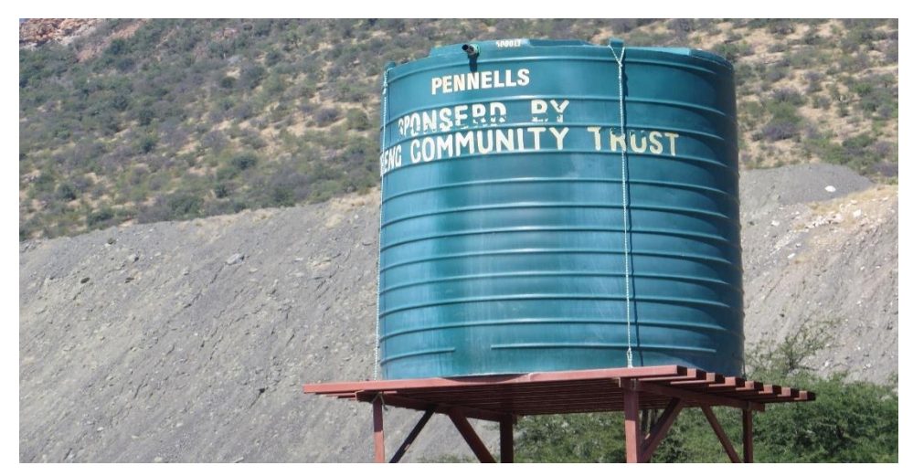
Above: A water tank at a borehole with the words "Sponserd [sic] by Jibeng Community Trust" painted on its side.

We photographed several standpipes and boreholes in Tjibeng, Ga-Mampa and Ga-Phasha, but it is not possible to verify whether those were part of SLP installations. None had Sefateng markings. It was not possible to verify via correspondence with Sefateng whether the tanks marked "Jibeng Community Trust" were constructed as part of the SLP programme.