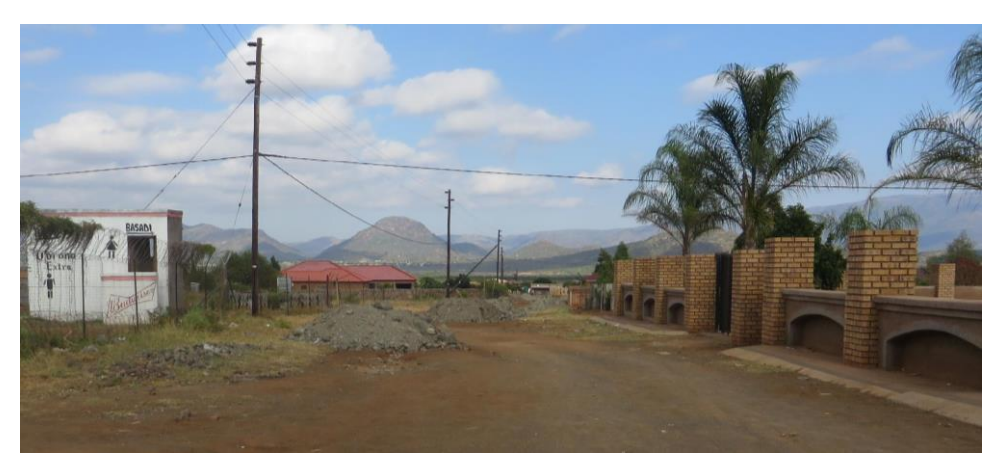
Above : Heaps of crushed stone at Mashishi village next to the road, which washed away in places.