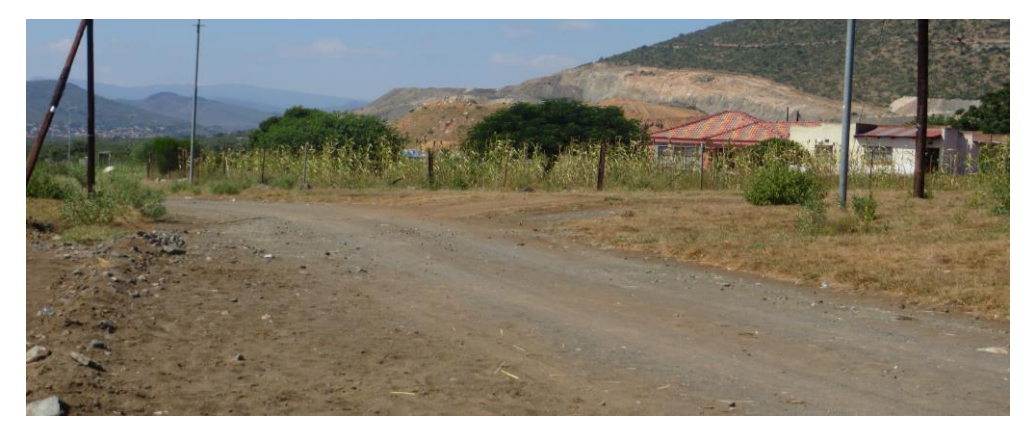
Above: The road in fair condition, with the Sefateng mine in the background

The pictures below were taken at Mangaka and show the road in poor condition, with several areas washed away. Project partners on the ground state that the road was re-gravelled in 2017, but that it was maintained or repaired only once in mid-2018. The repairs done were cosmetic and since then, the road washed away gradually as can be seen below.