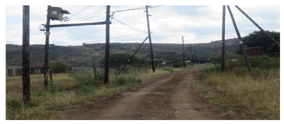
Above: The poor condition of the road at Manyaka village.

During the site visit on 9 April 2021 to villages Kgoete/Matuba Park, Mashishi and Manyaka which traverse the Winaarshoek, Driekop, Forest Hill and Clapham farms, images taken by the team suggested some work had occurred but that roads remained in very poor condition. Photographs taken of roads in the villages show heaps of crushed stone likely to be used for gravelling.