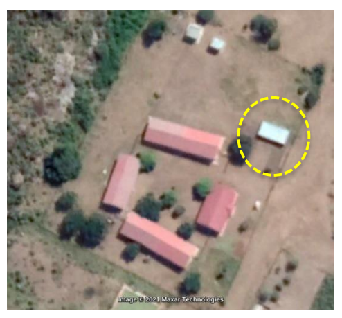
\textbf{Above left:} \ \textit{December 2012, four large buildings and two smaller ones are visible, December 2012.}

Above right: March 2020, only one small structure with a light roof to the right of the main complex has been added. The research team observed that this was not the administration block that was supposed to have been built be the end of 2018, but a carport. At the time of the site visit, the school's offices were located in the northernmost larger building with the red roof. This building predates the SLP commitments, since it is visible in the 2012 satellite image of the site.