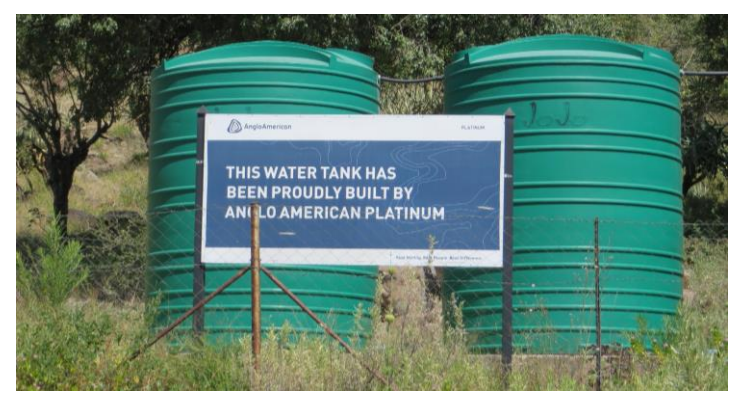
Above: Two of the lower Anglo JoJo tanks.

However, the response by Anglo Platinum to the findings does suggest that they have complied with the project commitments and have done substantial work. The response states that they have implemented the project in the villages of Ditwebeleng, Morapaneng, Dithabaneng, Mantjekane, GaMongatane (GaMashabela), GaMakgopa, Dikgopeng, Manaleng, Magobading, and Seelane. They further state that about 500,000 people "have received access to potable water". The full response on this and all projects is to be found in the response to the right of reply letter attached as Annexure II.