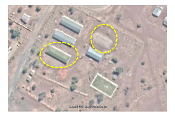
Above left: June 2018, Morwaswi School Tjibeng

Above right: July 2020, it seems like one building with a green roof was built, and one building just to the right and above the centre of the image was demolished between June 2018 and July 2020. The research team could not obtain access to the site to verify whether the newly built structure is the administration block referred to in the SLP.