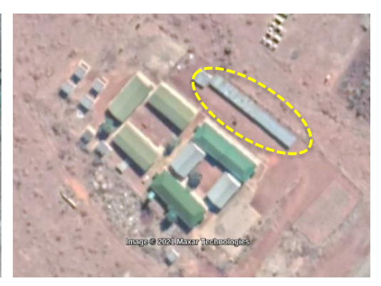
Above left: January 2017, Selatole High School.

Above right: July 2020, the only new structure that seems to have been erected during the time that construction of the 30sqm laboratory was planned for 2017 is a large, elongated new structure with a flat roof North East of the pre-existing buildings. This flat-roofed structure seems to have been built sometime between 23 August 2017 and 18 June 2018 according to satellite imagery. This structure is much larger than a single room, measuring 6m x 50m and resembling a long carport rather than a laboratory room.