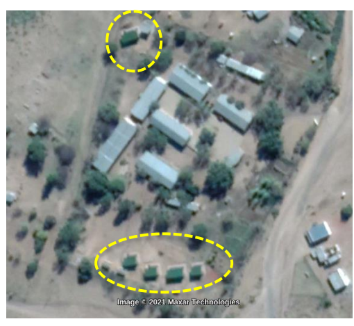
Above: June 2017, five small structures with green roofs have been built to the north and south of the school since June 2016. The research team could not access this site to verify completion. Given the size of these structures and their positions relatively far away from the other classrooms, these are likely toilets rather than the classroom referred to in the SLP.