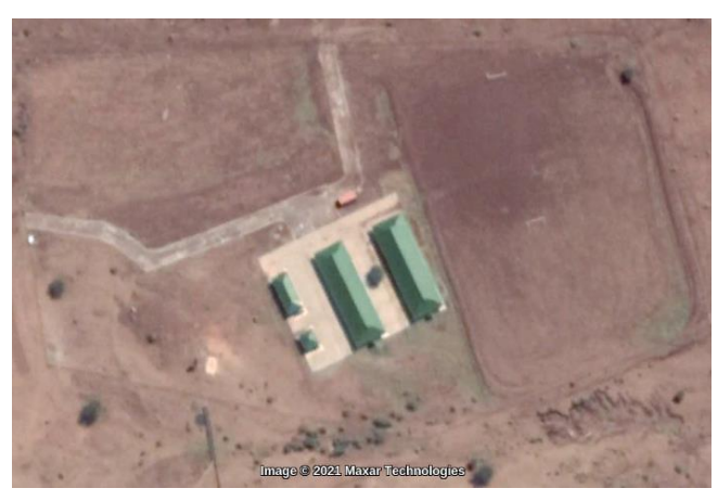
Maps data: Google © 2021 CNES / Airbus and Maxar Technologies

Above: March 2020, no new buildings are visible compared to the school as it was first built by mid-2017. It seems that the three "additional" classrooms mentioned in the SLP were not built as they were supposed by Q4 of 2018. Maps data: Google © 2021 Maxar Technologies