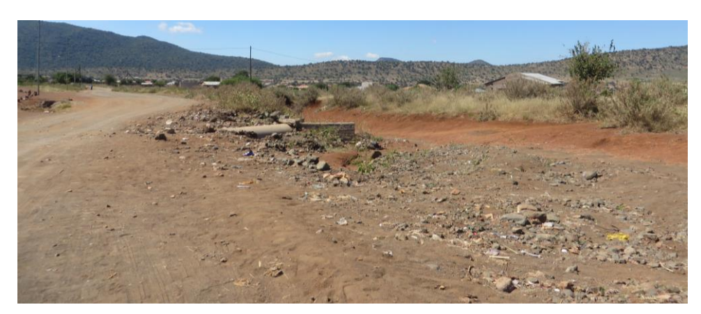
Above: The road in poor condition at a culvert.

The pictures below were taken at Mangaka and show the road in poor condition, with several areas washed away. Project partners on the ground state that the road was re-gravelled in 2017, but that it was maintained or repaired only once in mid-2018. The repairs done were cosmetic and since then, the road washed away gradually as can be seen below.