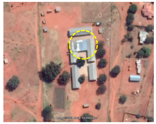
Above left: May 2019, Manku Primary School.

Above right: March 2020, one building seems to have been added to the courtyard of Manku School. The research team could not access the site to verify whether this was the kitchen referred to in the SLP.