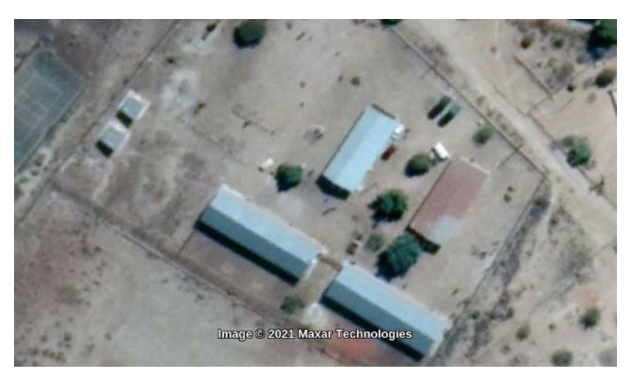
Above: Satellite image of Tekanang High School, August 2017